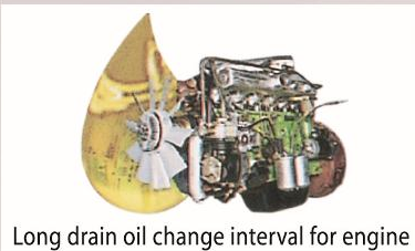
Long drain oil change interval for engine